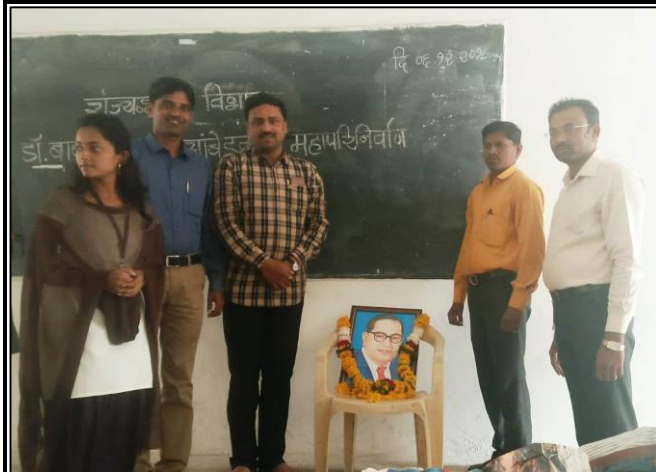
Departmental staff & student doing worship of Dr. Babasaheb Ambedkar